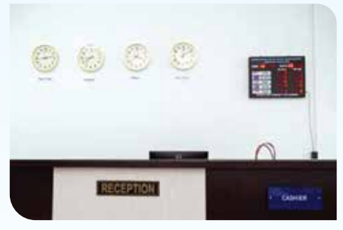
FRONT OFFICE LAB