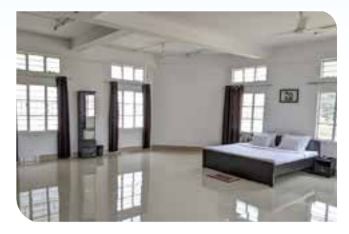
GUEST ROOM/HOUSE KEEPING LAB